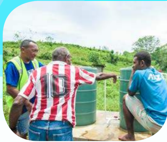
Etika and villagers close up on the built plumbing system.