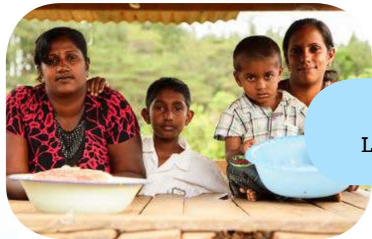
WATER FOR LIVELIHOODS