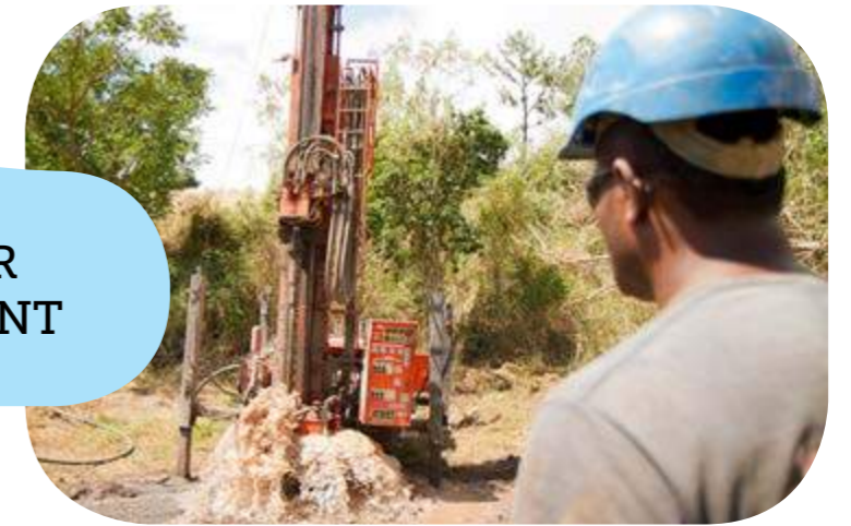
WATER FOR DEVELOPMENT