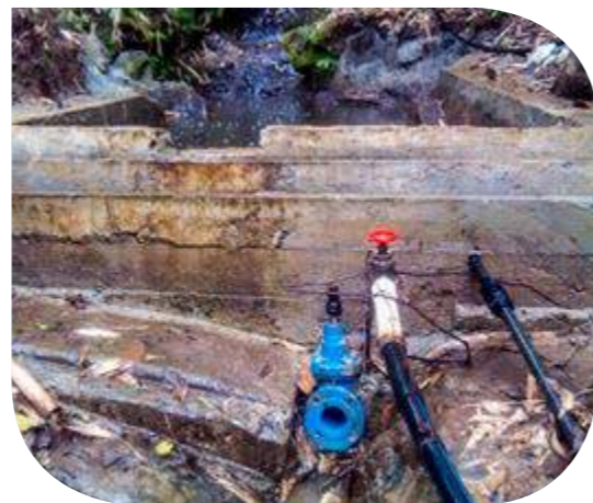
Plumbing details for damming of a typical gravity-fed piping water system.