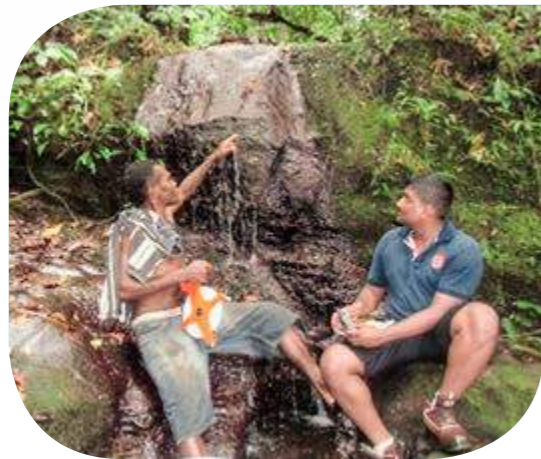
Ravi and villager assess the flow rate of water source.