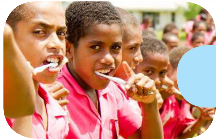
WATER FOR DIGNITY