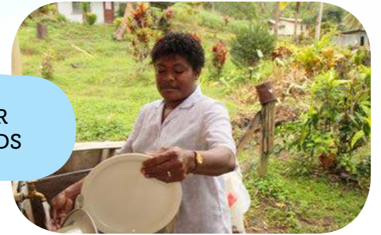
WATER FOR HOUSEHOLDS