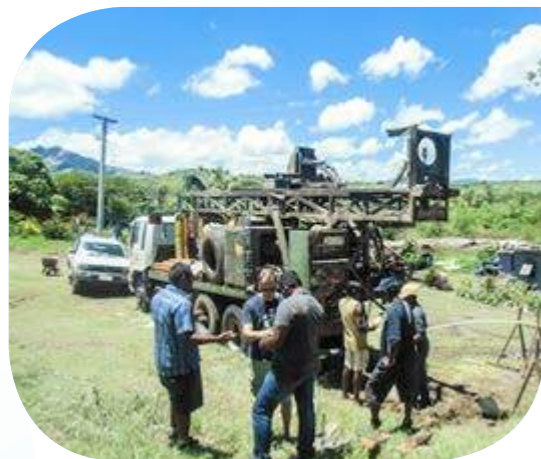
Field team discuss with drillers for bore-hole environment details.