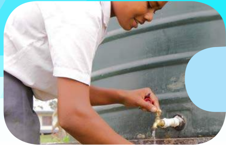
WATER FOR SCHOOLS