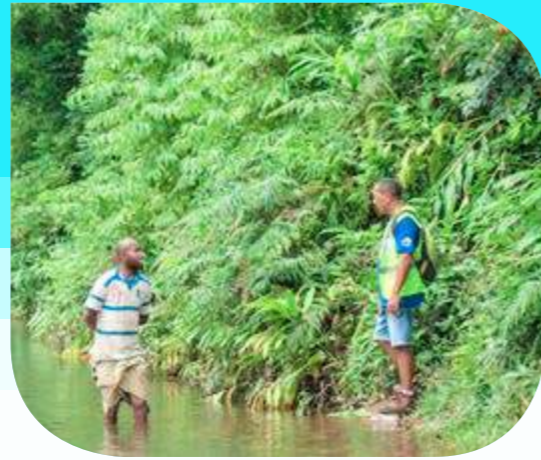
Trying to locate a suitable spot for suspended crossing over the river.